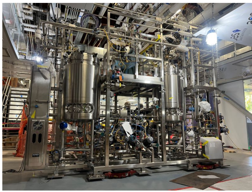
Top left: A process skid is suspended from the ceiling to allow installation of additional skids and equipment adjacent to and beneath it. Top right: Baker team members assist the vendor in preparing the complex equipment for installation. Above: The completed assembly. Middle and lower right: A forklift is used to maneuver a skid into the building at ground level.