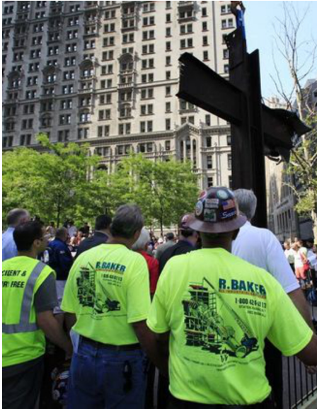
From left: World Trade Center Cross relocation ceremony; Koenig Sphere; lowering Ladder Co. 3 fire truck into the 9/11 Museum